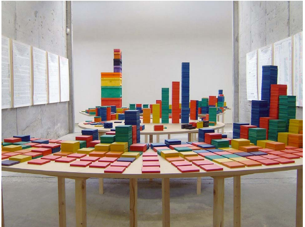
The Power of Power and the making of a symbol as installed at Extra City

In 2005 I was caught in front of the television for a whole night watching English elections on BBC. There were lots of charts, colours and speculation. The predicted outcome of the current election was repeatedly being compared to the results of past elections while the actual results, county by county, were being revealed. The English election system is complex and hard to explain, and for this reason there was a constant splash of 3D virtual illustrations superimposed on the screen. In this overly saturated display, the only thing clear was the colour representing each party. At the time I was already working on a study of European flags– analyzing and describing them in words according to form and colour. I Became curious about the relationship between people’s obsession with colour coding and the meaning attributed to this colour system.