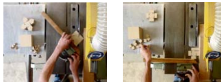
Screen shots from videos The making of a symbol 45° and 90°

On two monitors The Making of a Symbol repeatedly shows the subtraction of bits and corners from wooden squares—at different angles—and how through this, a symbol is made.