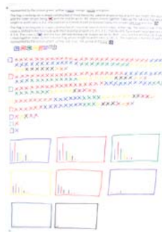
One out of the 16 charts.

In 2005 I was caught in front of the television for a whole night watching English elections on BBC. There were lots of charts, colours and speculation. The predicted outcome of the current election was repeatedly being compared to the results of past elections while the actual results, county by county, were being revealed. The English election system is complex and hard to explain, and for this reason there was a constant splash of 3D virtual illustrations superimposed on the screen. In this overly saturated display, the only thing clear was the colour representing each party. At the time I was already working on a study of European flags– analyzing and describing them in words according to form and colour. I Became curious about the relationship between people’s obsession with colour coding and the meaning attributed to this colour system.